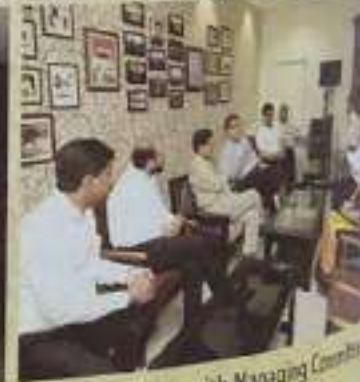
Interaction with Managing Committee