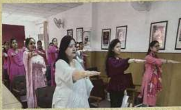
22.04.2023, Pledge Ceremony on the occasion of Earth Day