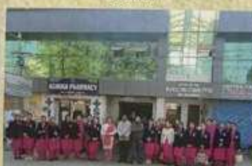
16.12.22, Visit to Municipal Corporation, Bari Brahamana