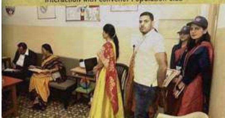
Interaction with NSS programme Officer