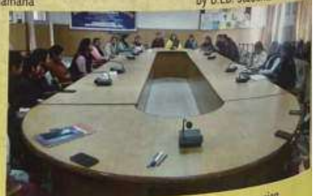
15.02.2023, Inter House Group Discussion