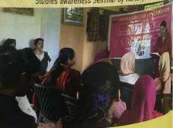
03.07.2023, Awareness Lecture on different schemes launched by Prime Minister to the Women of Bhatyari Village