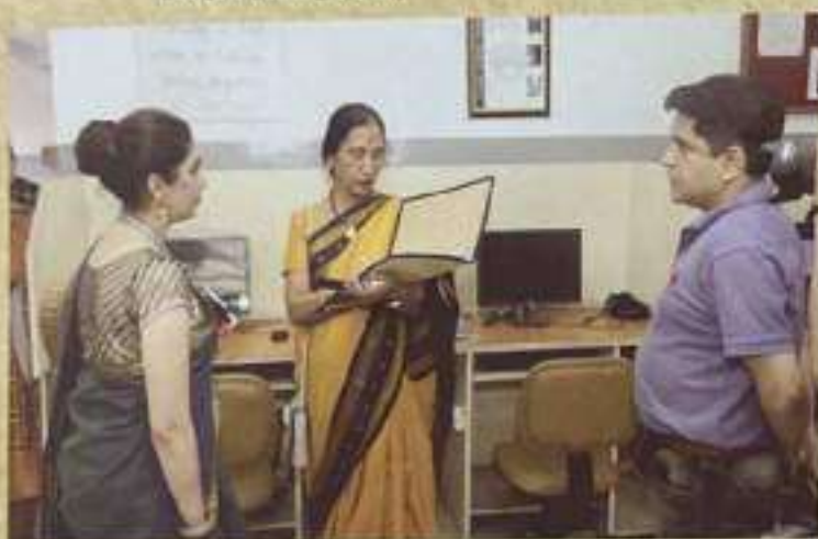
Interaction in IT Lab