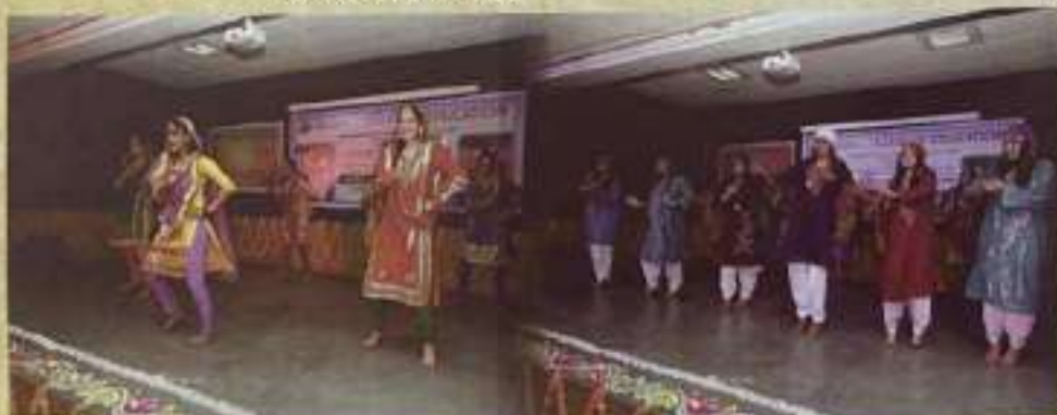
Cultural Programme (Dogri & Kashmiri Dance)