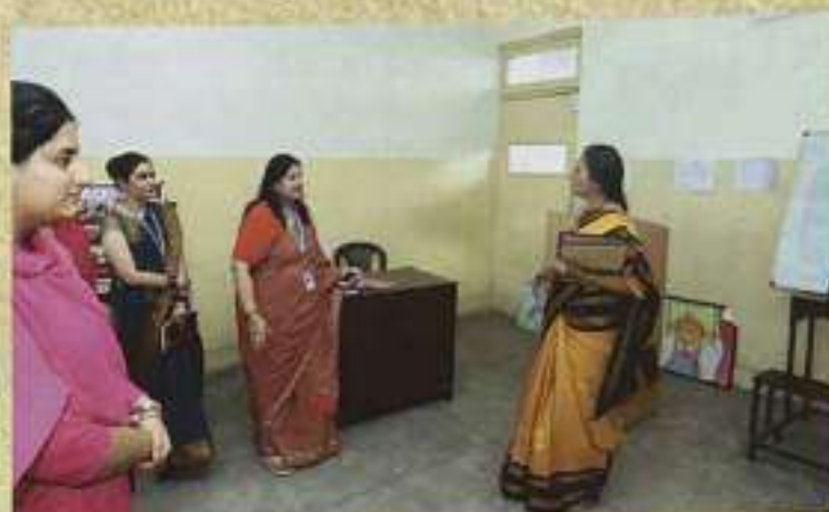
Interaction with Convener, Literary Club