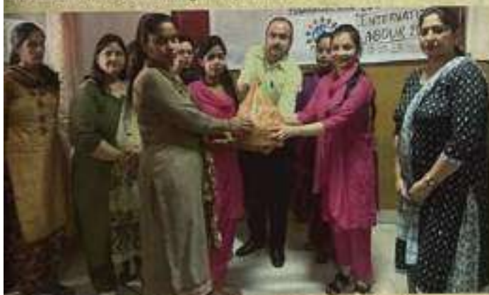
01.05.2023, International Labour Day Celebration