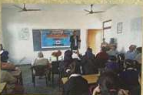
01.12.2022, Awareness Lecture on World AIDS Day at Govt. Middle School, Bhatyari