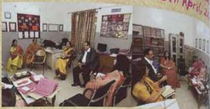
Interaction with Faculty members in IQAC Room