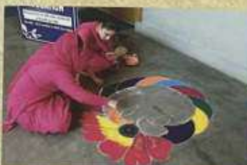
22.10.2022, Rangoli Making Competition on Diwali