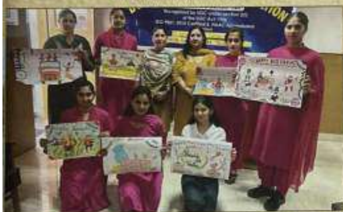
13.04.2023, Poster Making Competition on the occasion of Baisakhi