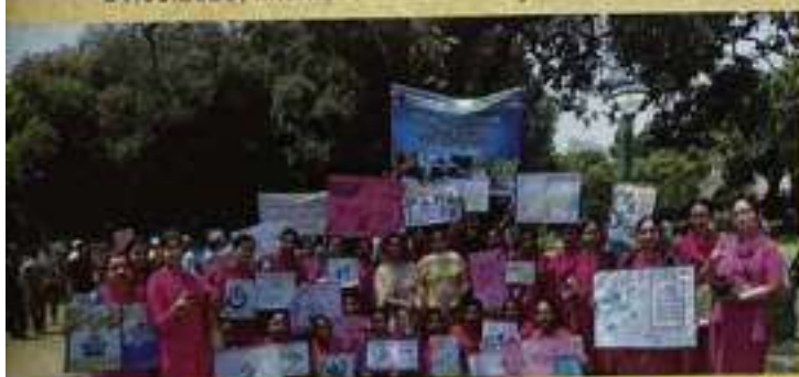
06.05.2023, Save Water Save Bird campaign held at Zanana Park, Dogra Sadar Sabha