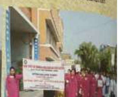
31.10.2022, Run for Unity on the occasion of National Unity Day