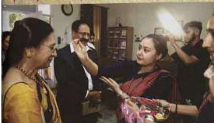
Welcome of NAAC PEER Team