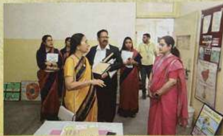
Interaction with Convener Environmental Club