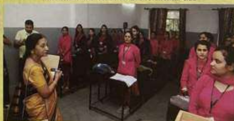
Interaction with Students in Classrooms