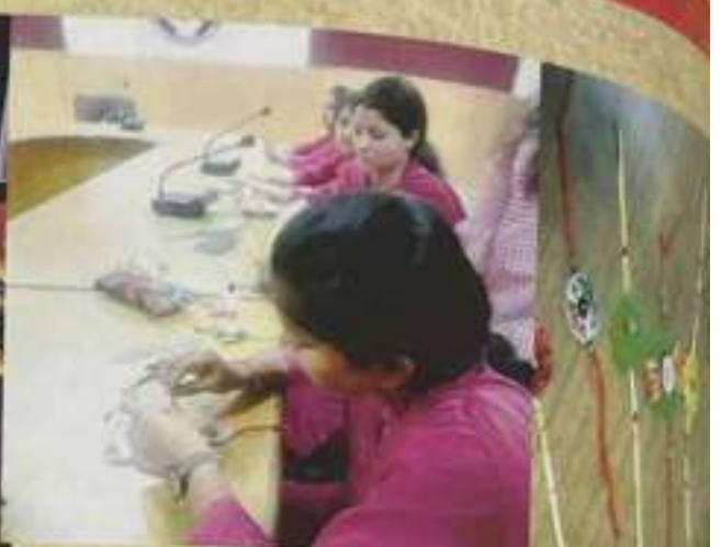
05.08.2022, Rakhi Making Competition on the eve of "Raksha Bandhan"