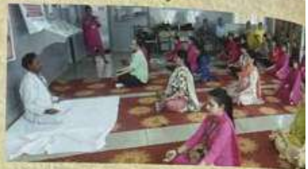
21.06.2023, International Yoga Day Celebration