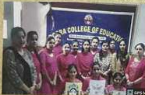
3.10.2022, Durga Face Drawing Competition on the occasion of Navratra