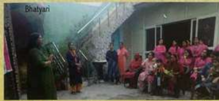
31.05.2023, Awareness Lecture on Cleanliness at Village Dollian