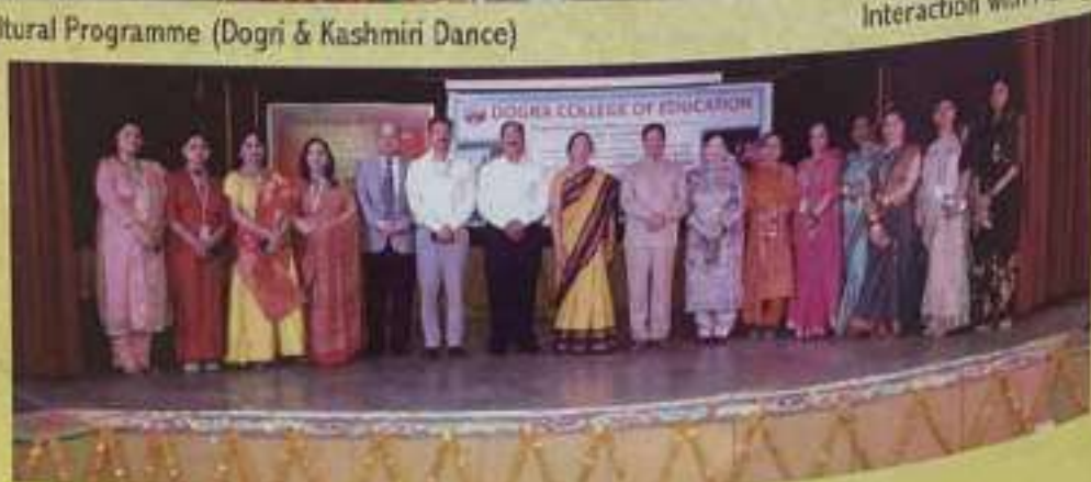
Group Photograph during exit meeting