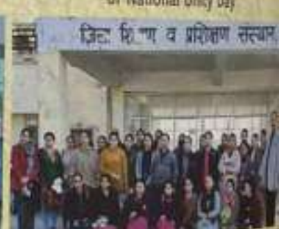
27.01.2023, Visit to DIET, Samba by B.ED. Students