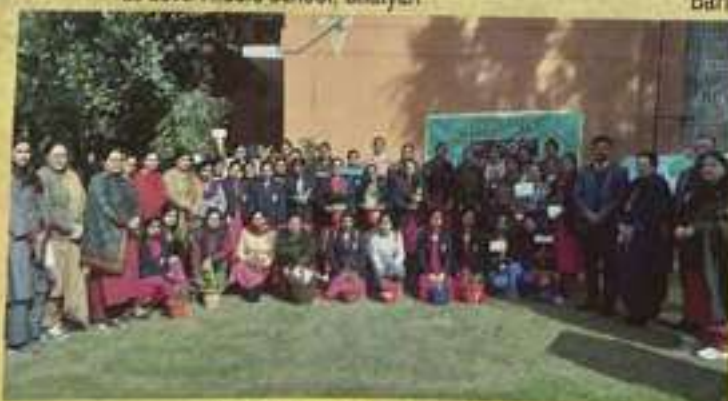
13.02.2023, Plantation Drive