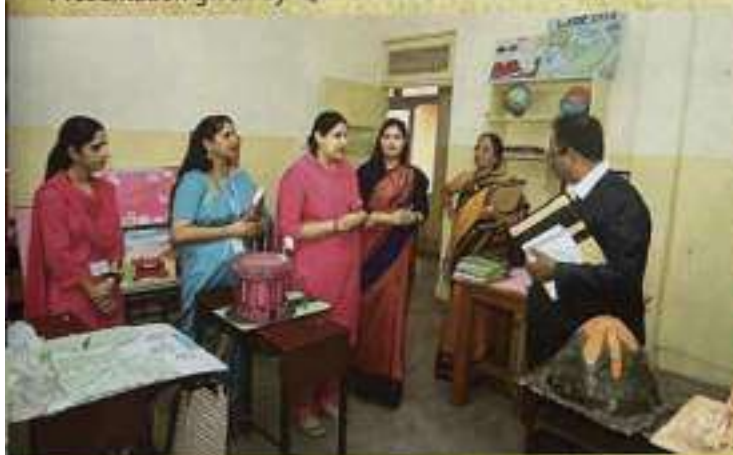
Interaction with Convener Population Club