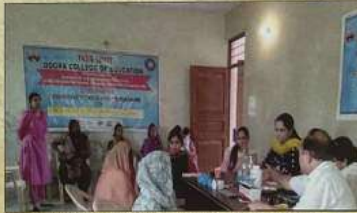
12.06.2023 & 13.06.2023, Health Check Up Camp at Village