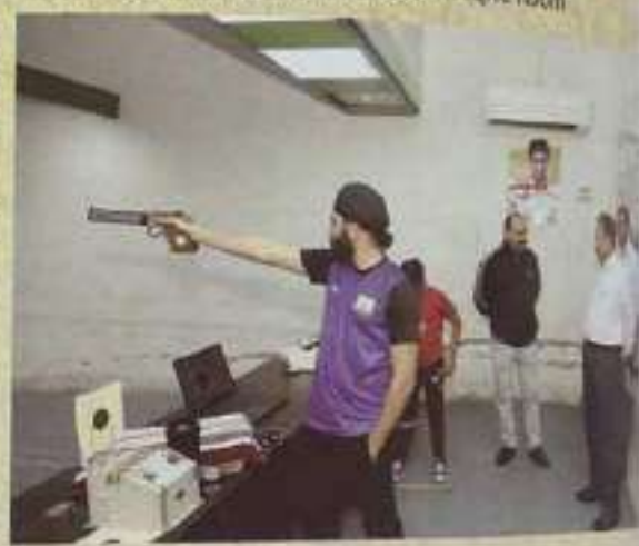
Interaction in Shooting Range Area