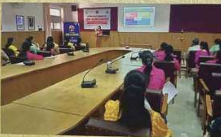
22.03.2023, Awareness Rally on World Water Day