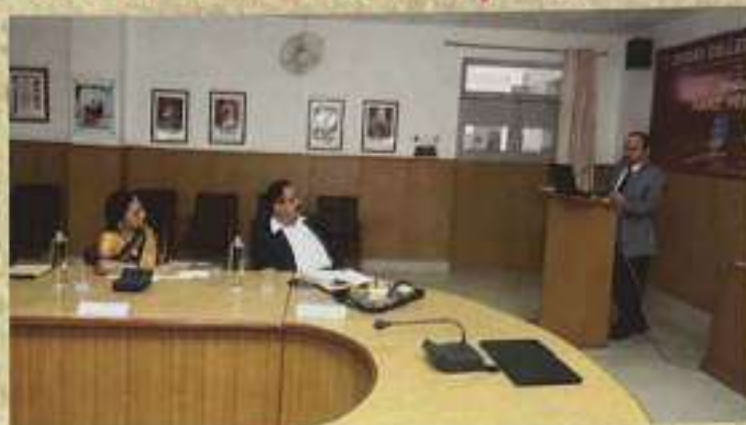
Presentation given by Principal to NAAC PEER Team