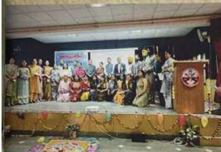
08.03.2023, Alumni Meet