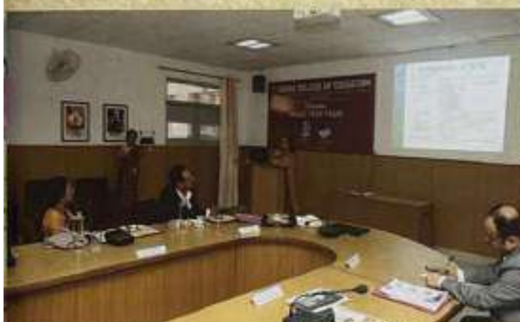
Presentation given by IQAC Coordinator to NAAC PEER Team