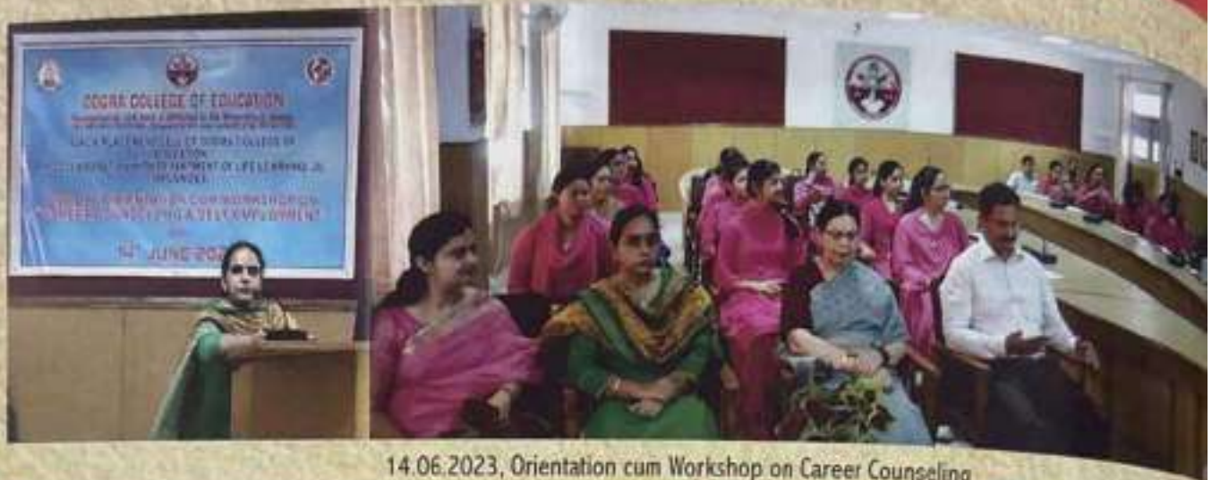
14.06.2023, Orientation cum Workshop on Career Counseling