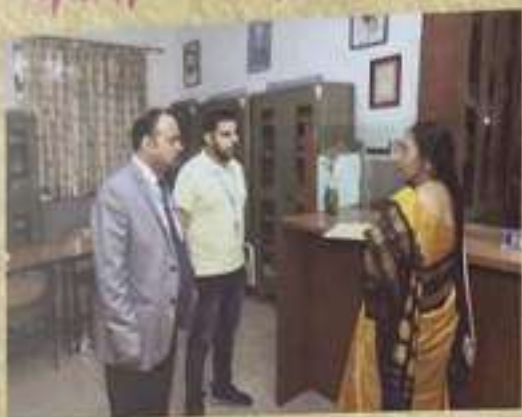
Interaction in Library