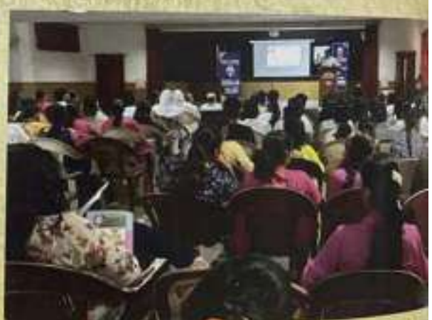
17.06.2023, "Career Counseling/Skill Development & Gender Studies awareness Seminar by Kartavya Academy"