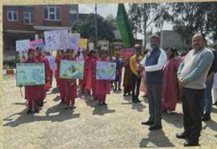
22.03.2023, Awareness Rally on World Water Day